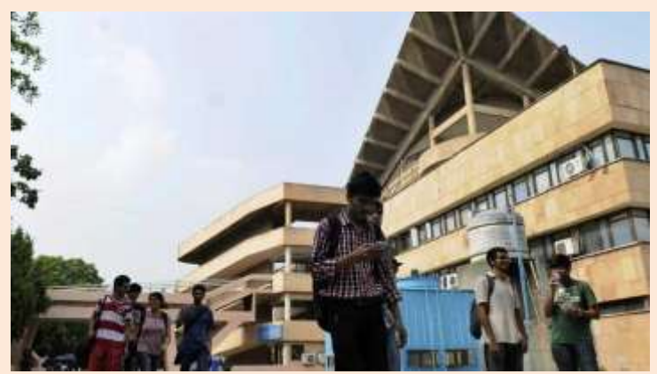
IIT Delhi will offer new public policy making course

The school, which is presently recruiting its first batch of faculty, will offer courses in areas such as internet, digital information and society, industry and economy, energy and environment, agriculture, food and water, among others.