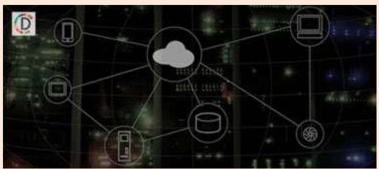
The new course will have 20 seats and the eligibility is clearing the JEE-Advanced test.

https://www.devdiscourse.com/article/technology/325870-ai-education-strengthens-in-india-withannouncement-of-dedicated-course